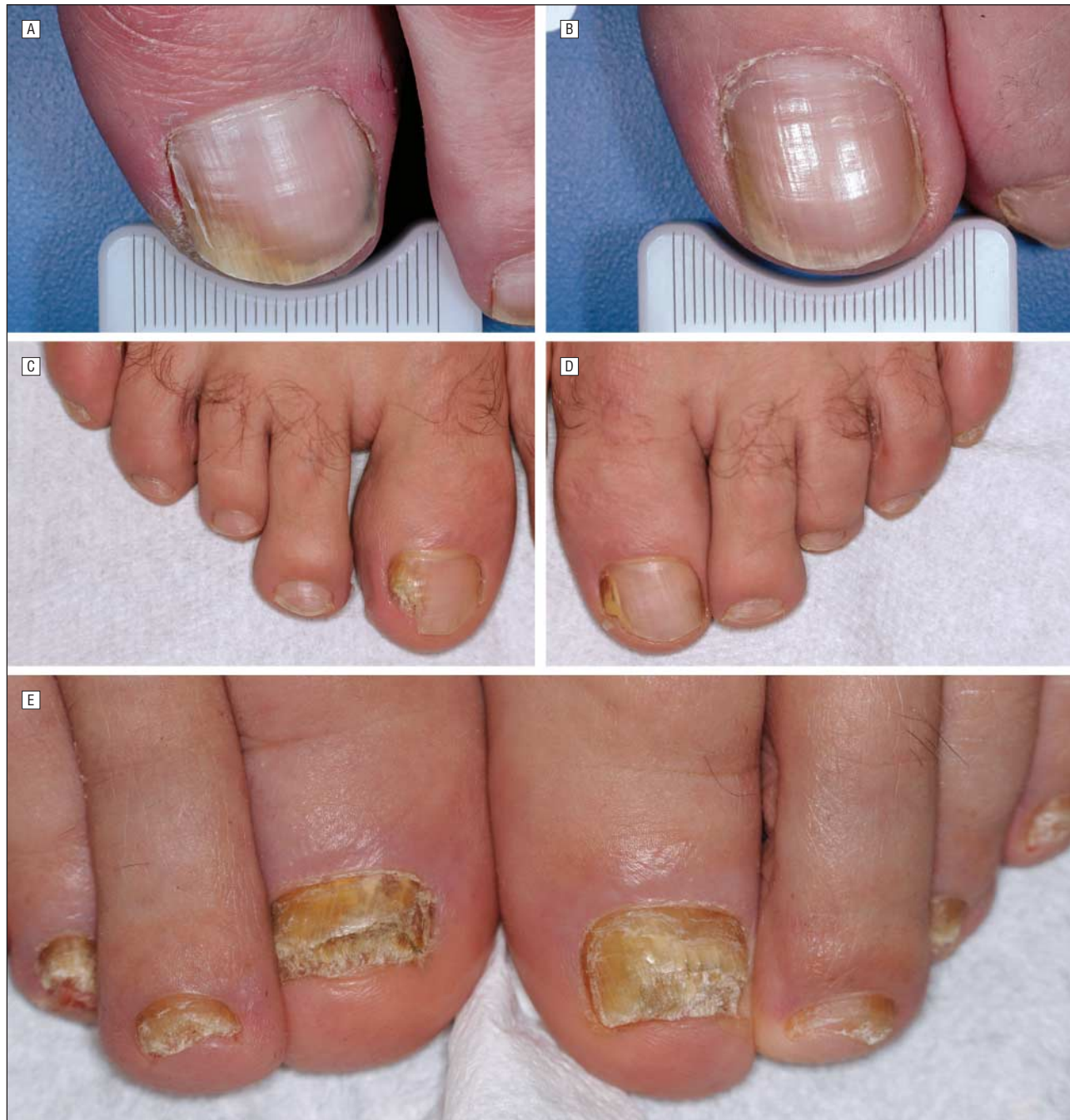
Figure 3. Examples of mild, moderate, and severe nail involvement scored using the Onychomycosis Severity Index system. A, This nail receives a score of 2 (for area of involvement) multiplied by 2 (for proximity of disease to the matrix) for a total of 4. No dermatophytomas or hyperkeratosis is present. This nail has mild involvement. B, This nail receives a score of 1 (for area) multiplied by 3 (for proximity of disease to the matrix) for a total of 3. This nail has mild involvement. C, The great nail receives a score of 3 (for area) multiplied by 4 (for proximity of disease to the matrix) for a total of 12. No dermatophytoma or hyperkeratosis is present. This nail has moderate involvement. D, The great nail receives a score of 1 (for area) multiplied by 5 (for proximity of disease to the matrix owing to matrix involvement) for a total of 5. A lateral streak is present for an additional score of 10. This nail receives a score of 15, which denotes severe involvement. E, The right great nail receives a score of 5 (for area) multiplied by 5 (for proximity of disease to the matrix owing to matrix involvement) for a total of 25. Thick subungual hyperkeratosis is present, for which we add 10 points for a total of 35. This nail has severe involvement.

the photographs in Figure 3. The physicians and students recorded their scores on a grading sheet. Each answer was reviewed and compared with the answers from the consensus group. Although some variation occurred within actual numeric scores, almost all nail scores corresponded to the consensus group's severity category. There were 15 errors among the 136 photographs graded by the 17 participants. All errors were related to misidentification of dermatophytomas, that is, nails were given an additional 10 points for the presence of a