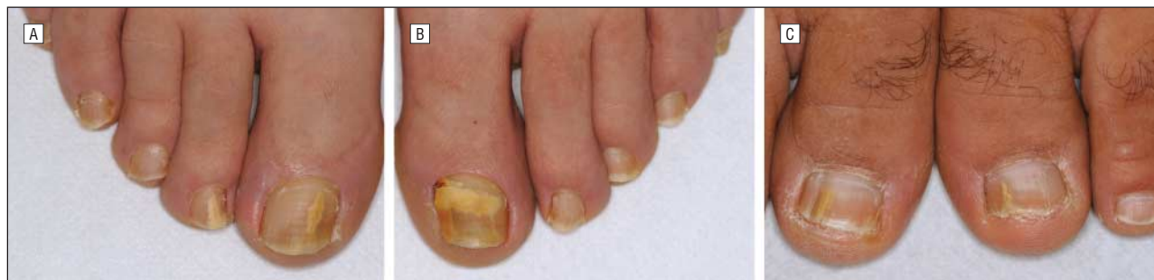
Figure 2. Examples of dermatophytoma. A, Yellow patch. Note that the borders of the patch are not contiguous with the distal edge. B, Large yellow patch. C, Yellow streaks.